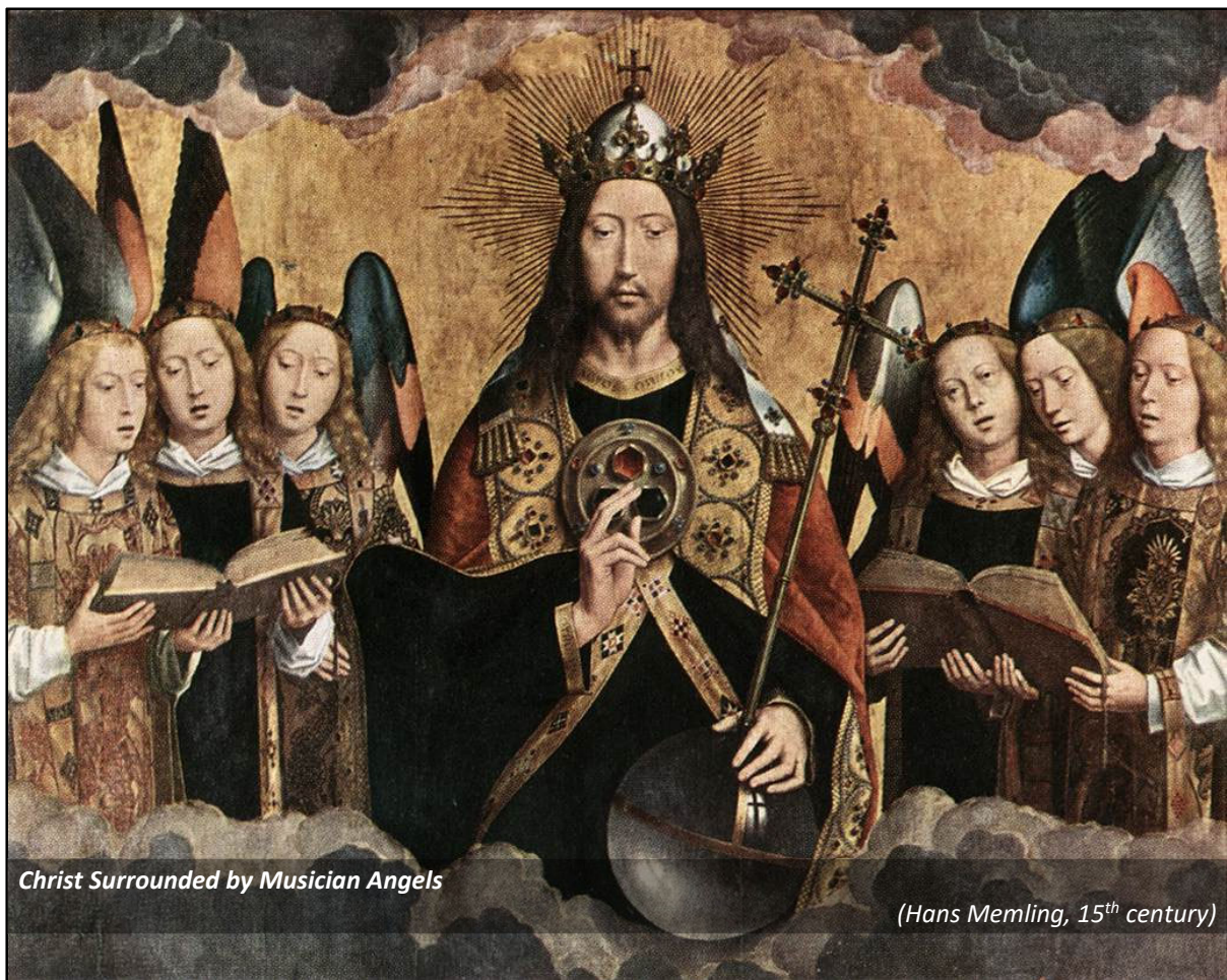
Christ Surrounded by Musician Angels