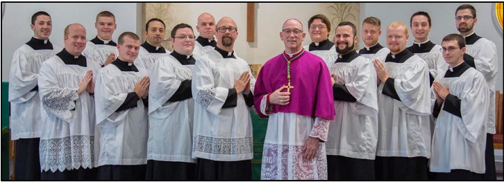
Pray for our seminarians! Pray for vocations!