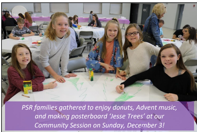
PSR families gathered to enjoy donuts, Advent music, and making posterboard 'Jesse Trees' at our Community Session on Sunday, December 3!

RELIGIOUS EDUCATION, FIRST SACRAMENTS, CONFIRMATION: As of August 2017, we are directing a "whole-family catechesis" program for families, sacramental preparation classes on Sundays, as well as other classes for youth and adults. Please email sjwdre@saintjosephozark.org for more information.