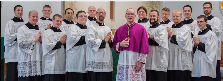
Pray for our seminarians! Pray for vocations!

12-19: 5:30-7:30 p.m. @ St. Joseph the Worker, Ozark