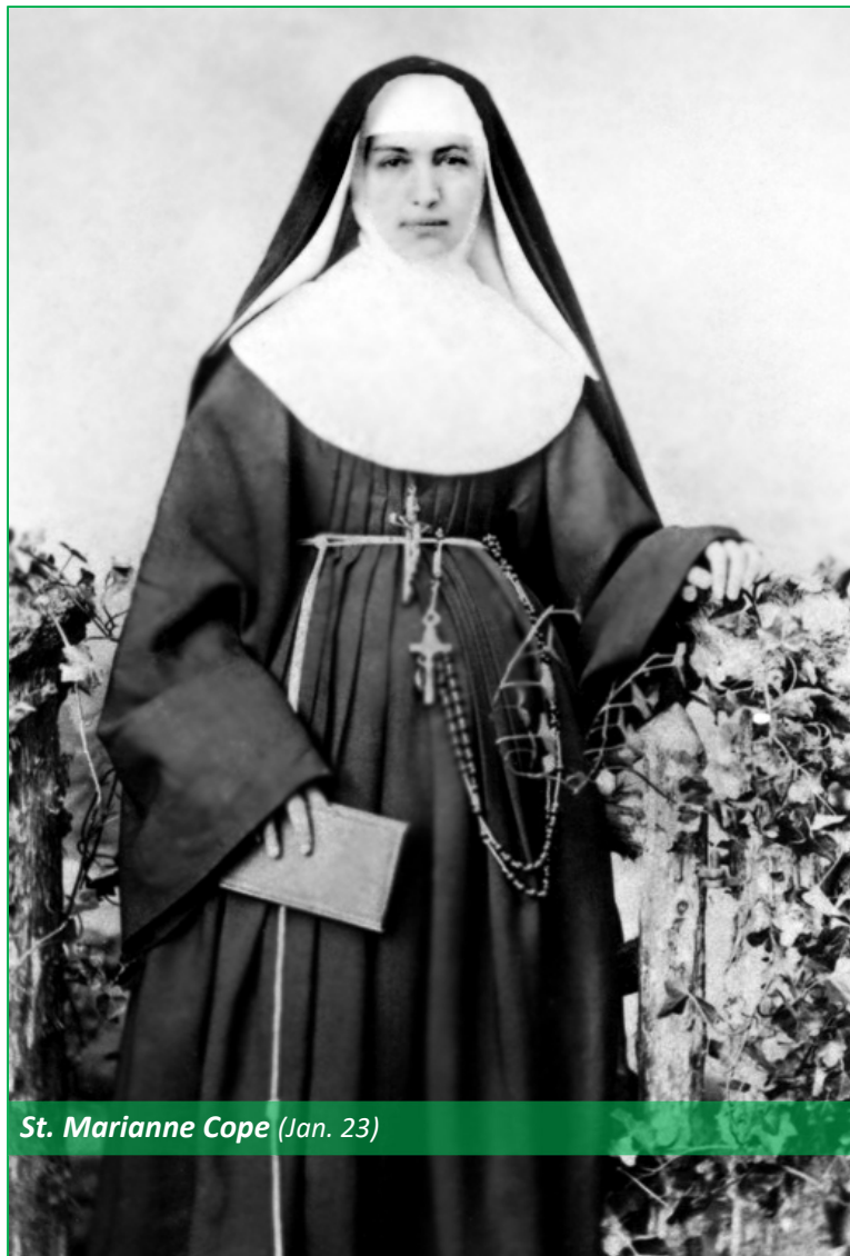
St. Marianne Cope (Jan. 23)