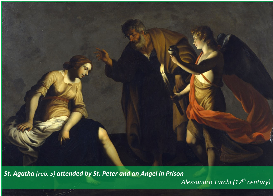
St. Agatha (Feb. 5) attended by St. Peter and an Angel in Prison