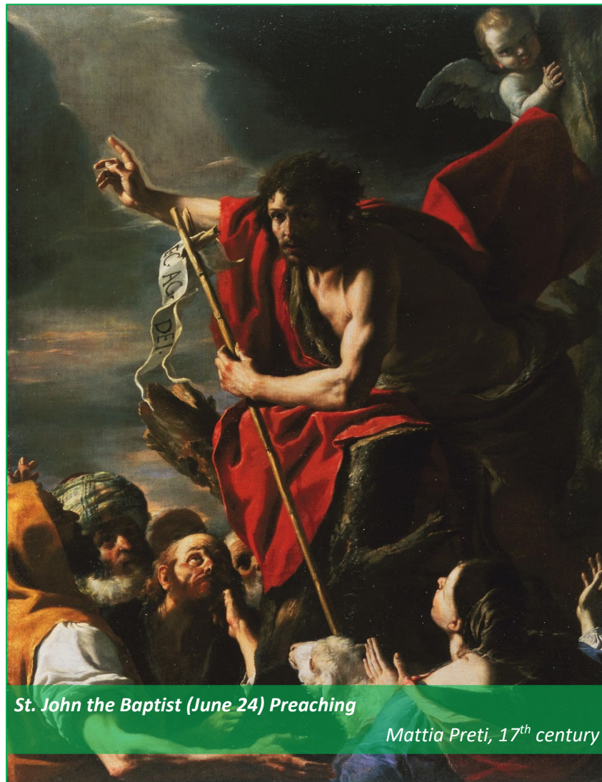
St. John the Baptist (June 24) Preaching