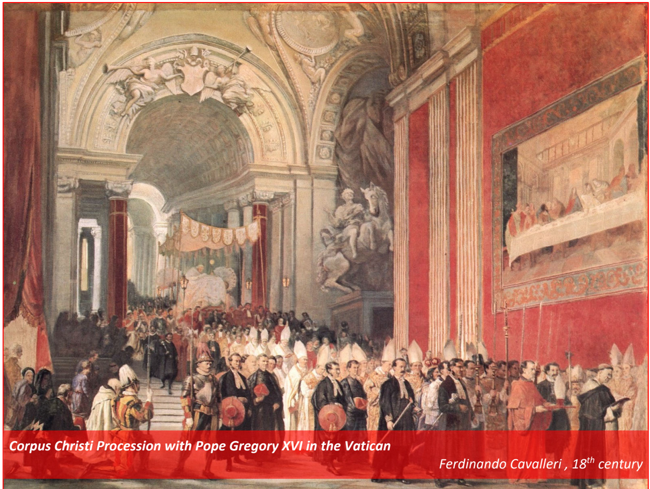
Corpus Christi Procession with Pope Gregory XVI in the Vatican