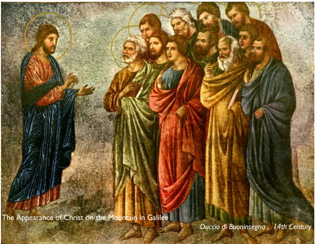
The Appearance of Christ on the Mountain in Galilee