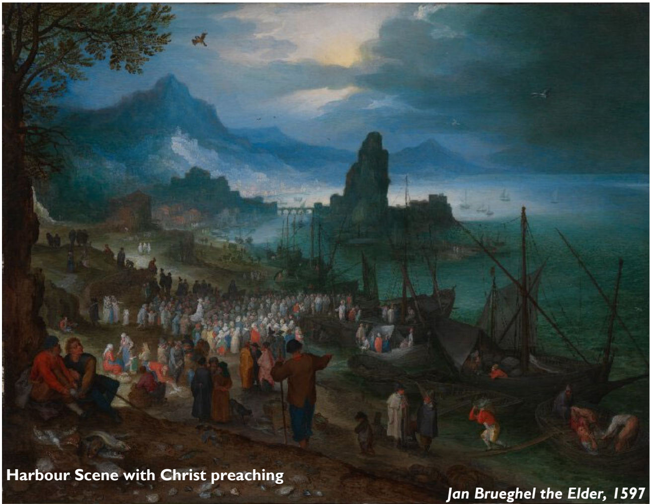
Harbour Scene with Christ preaching