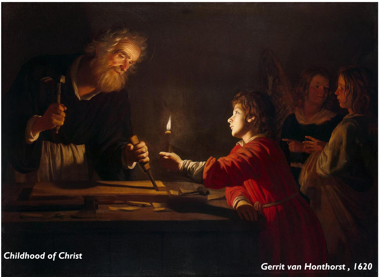
Childhood of Christ